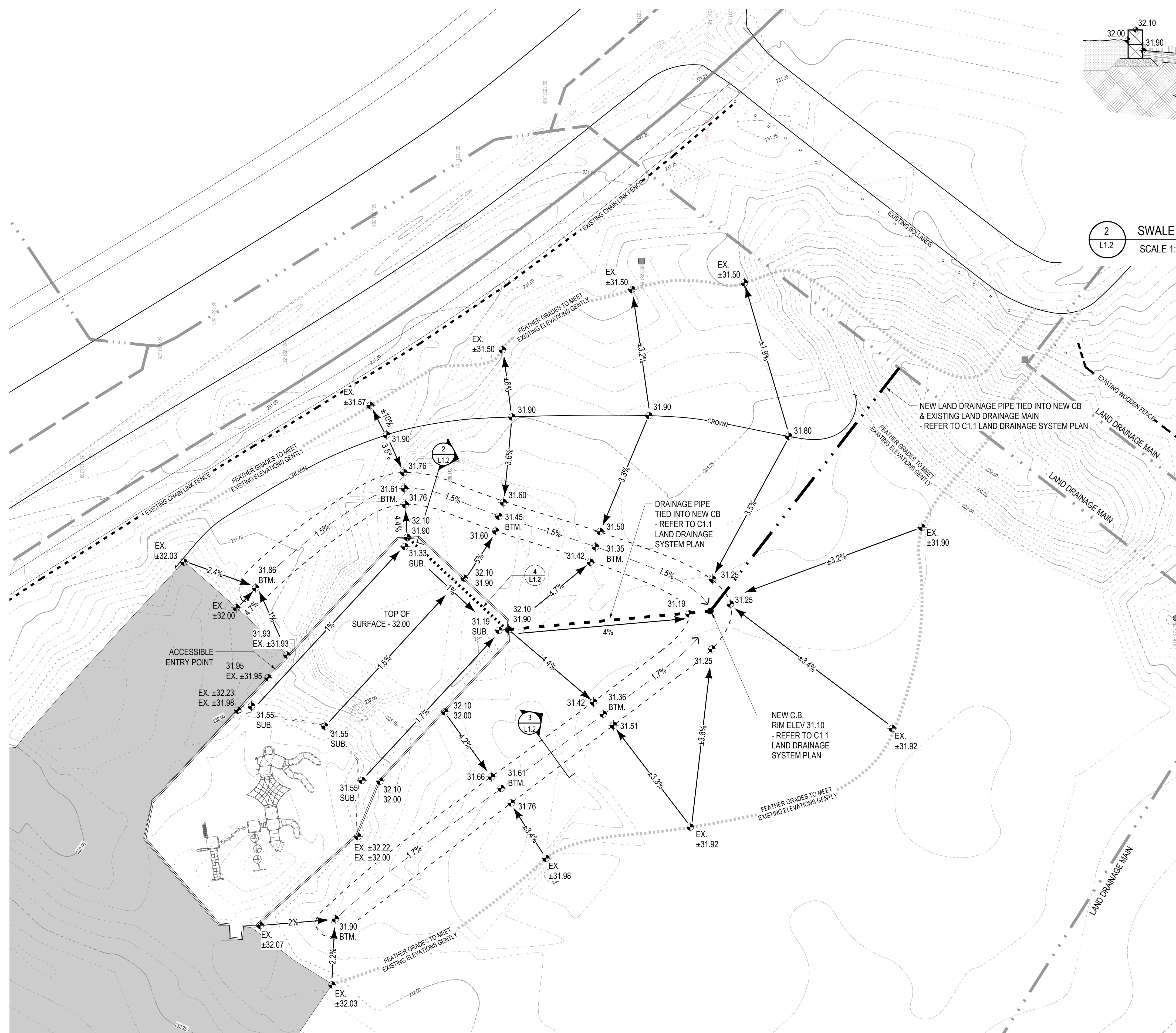
1 L1.2 GRADING PLAN SCALE 1:200